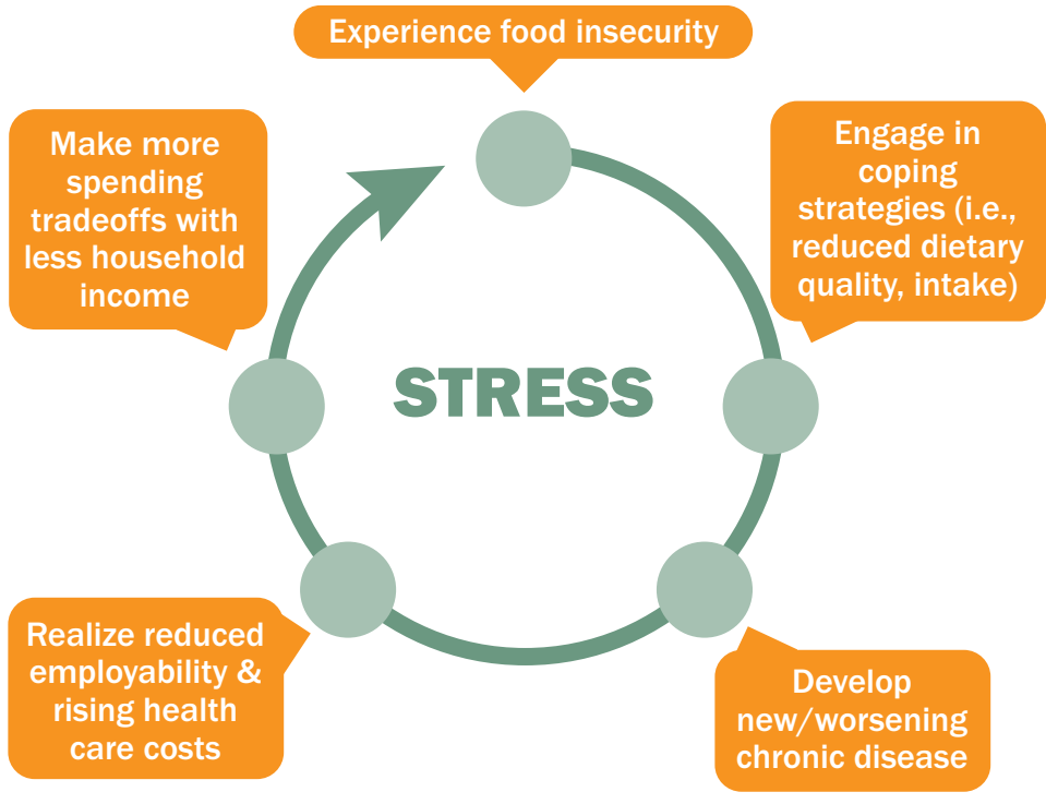
Adapted: Feeding America Hunger + Health Conceptual Framework

Food insecurity has serious longterm consequences for health and well-being.