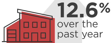
2-bedroom unit in Ohio