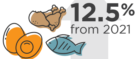
Meat, fish, and egg prices

Despite having recovered 85% of jobs lost during the COVID-19 pandemic, high inflation has wiped out many gains Ohioans had made.